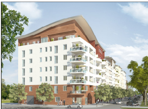
Apartment building in Berlin-Charlottenburg