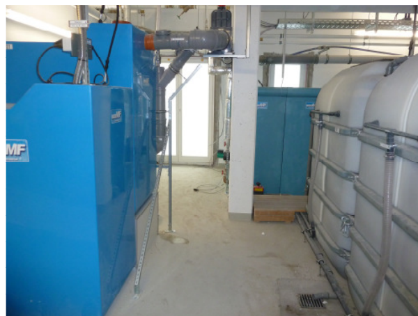
Technical room with waste water recycling system