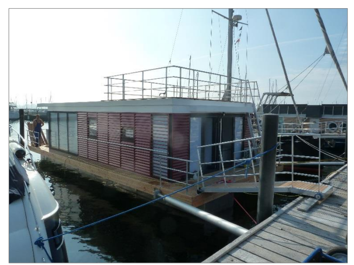
Floating home at the berth after commissioning of the BUSSE-MF