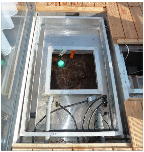
Membrane stage (filled) integrated in the floating body