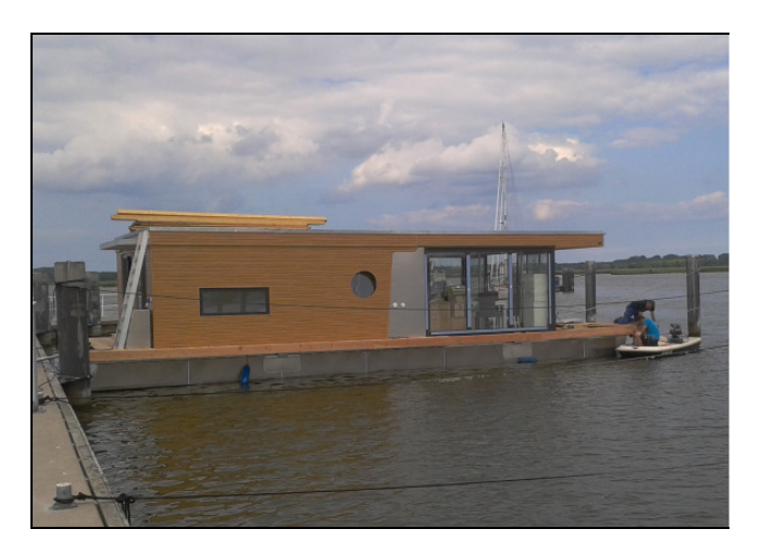
Exterior view of the floating home at the marina Kröslin