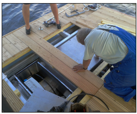
Tank 1: Septic tank with additional space for equipement in the starbord-floating body