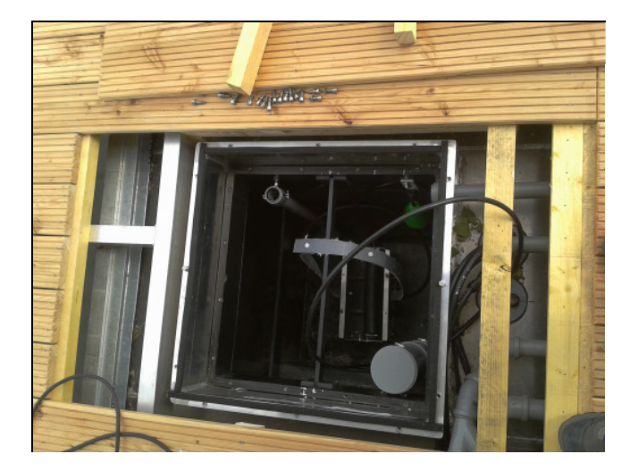
Tank 2: Membrane stage in the portside-floating body