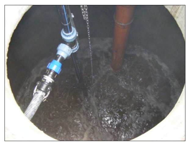
Septic tank with pumping unit