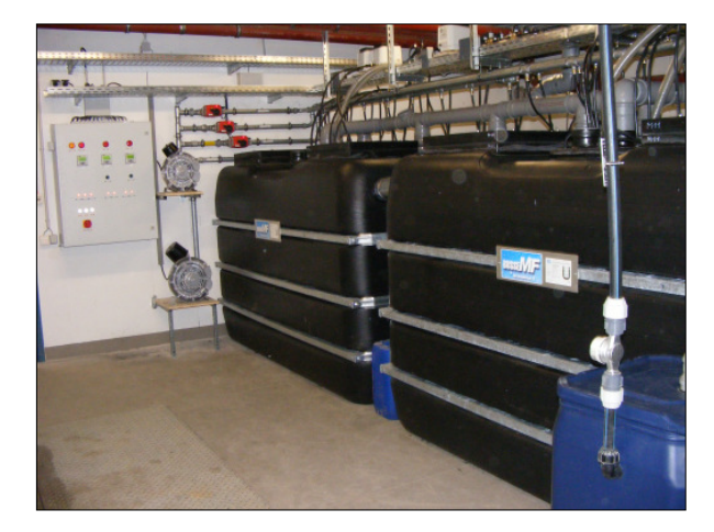
Small scale sewage treatment system