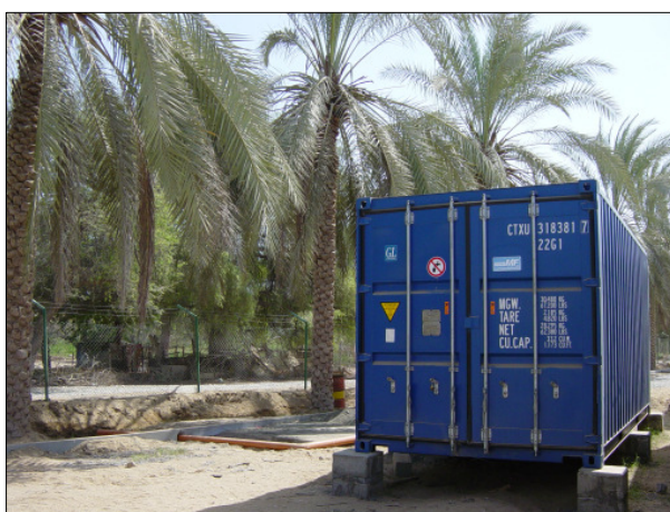
View from the outside