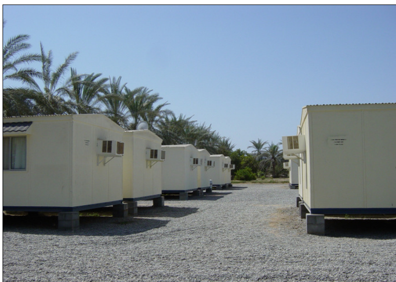
Camp in the desert