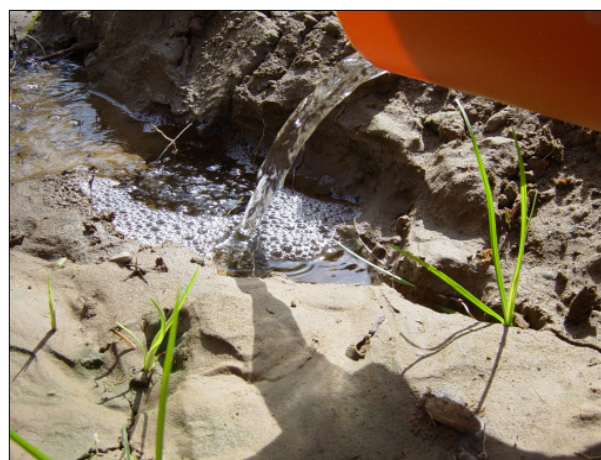
Irrigation of the desert with micro filtrate (outlet)