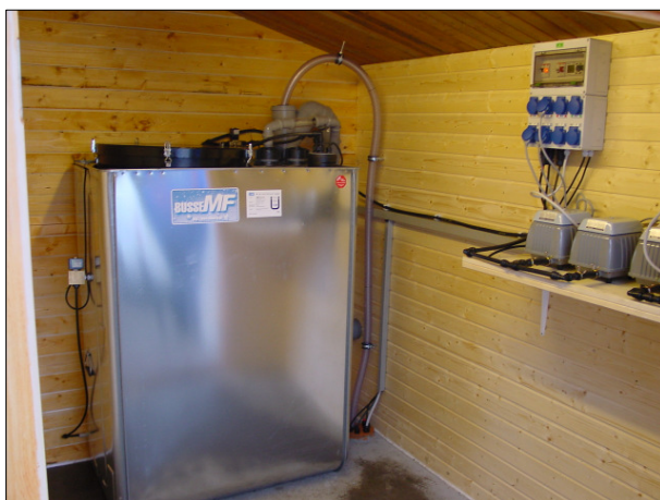
Double-wall safety tank