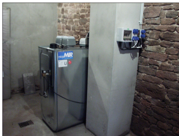
Double-wall safety tank